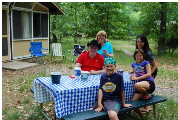
Three generations of Reneker Family Campers

An Owasippe Adventure is available for all members of your Webelos Family. Staff led programs, organized by age group, are available for all family members over the age of four. You may reserve a cabin at Reneker for the week your Scout is at camp and have him join you before or after Webelos Camp. Each cabin comes with a full kitchen and two bedrooms. Washroom, shower, and laundry facilities are at a central shower house. Click below for more information.